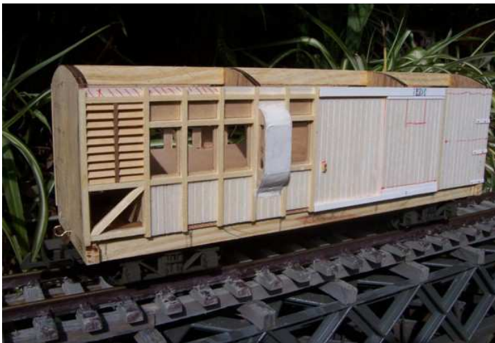
Passenger compartment end during build process.