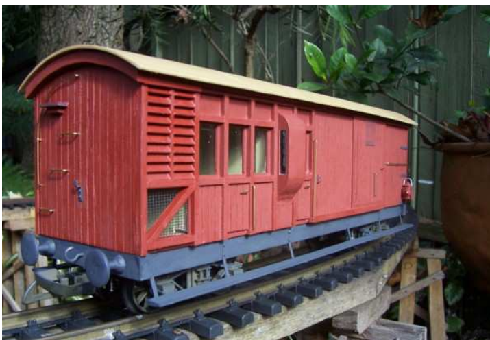
Three quarter view of whole of BGV 643.