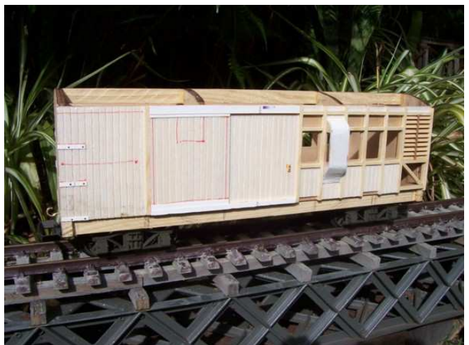
Goods compartment end, scribed balsa siding.