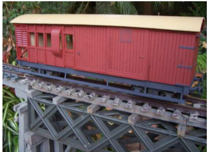
The BTR model of the BGV 643 completed.