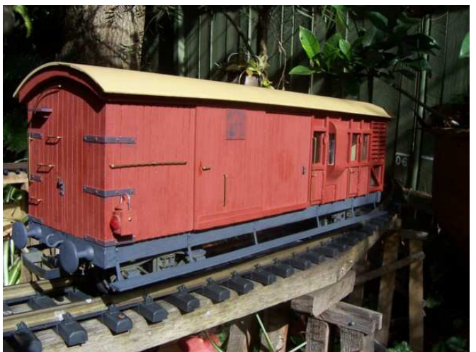
The completed wagon ready for work.

Louvres are individual slats of slit pine. Handrails, door handles and hinges, step rungs and running board brackets are brass strips and wire, buffers are buttons glued to corkboard thumb pins, wheels are LGB spoked, bogie frames are USA Trains. Paint is Humbrol brand applied with brushes.